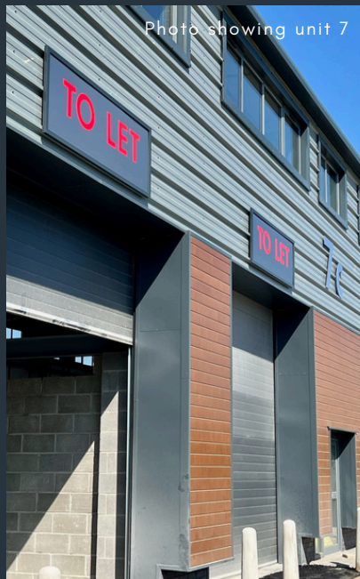
Photo showing unit 7

Each unit boasts aluminium double glazed doors and windows, powerfloat concrete floors and rooflights with 6m clear eaves height and 4m high sectional doors.