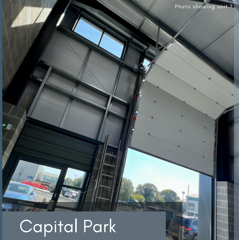
Photo showing unit 7

£13,330 to £79,992 per annum plus VAT, exclusive of rates and other outgoings.